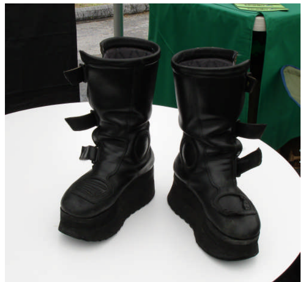
Sue's boots, purchased in 1992, have been resoled multiple times during their 500,000 miles of use. The glued inserts have held up through snow, rain, sleet, hail, and 118 degrees of desert heat.

So, I went to our local shoemaker, Frank, and explained my problem. I asked him if he could insert a lightweight lift like those used on orthopedic shoes to assist individuals having one leg shorter than the other. In my case, I simply had two 'shorter' legs.